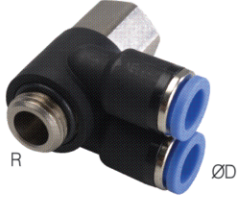
Dual Female Banjo