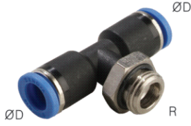
Male Branch Tee