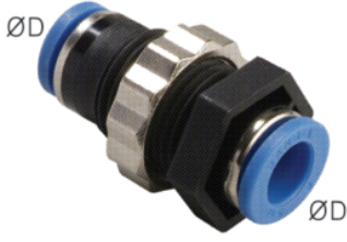
Bukhead Union P