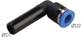
Plug-in Reducer Elbow