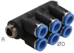
Triple Branch A