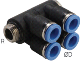
Double Branch A