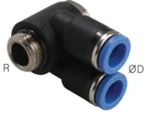
Double Branch A